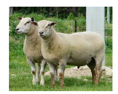
Charollais Lot 47