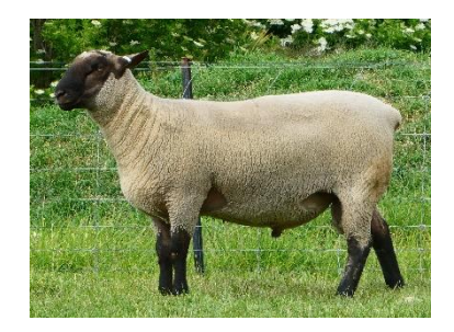
South Suffolk Lot 33

Contact: Cell: 027 202 5679 Email: cahampton@xtra.co.nz FB: Waterton Sheep Stud