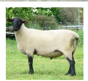
Suffolk Lot 5